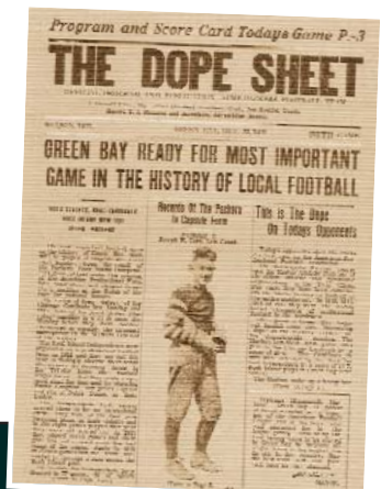
Two years after he co-founded the Packers with Curly Lambeau, George Calhoun began writing a piece called The Dope Sheet, which served as the official press release and game program from 1921-24.