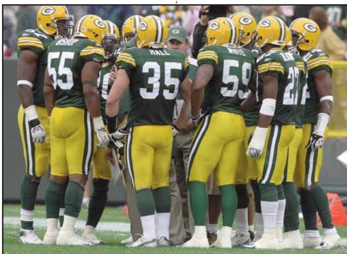
The special teams huddle