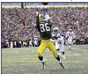
Al Tielemani/Sports Illustrated