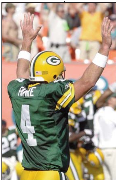
Favre enters 2007 with 147 career wins