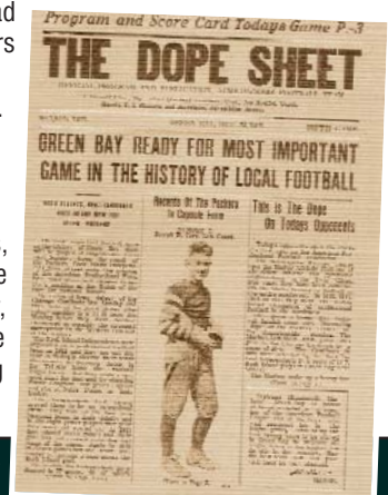
Two years after he co-founded the Packers with Curly Lambeau, George Calhoun began writing a piece called The Dope Sheet, which served as the official press release and game program from 1921-24.