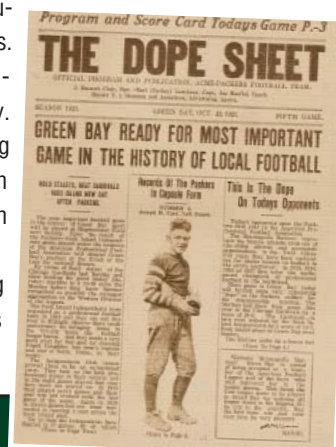
Two years after he co-founded the Packers with Curly Lambeau, George Calhoun began writing a piece called The Dope Sheet, which served as the official press release and game program from 1921-24.