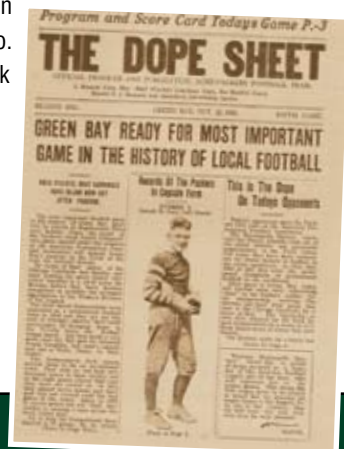
Two years after he co-founded the Packers with Curly Lambeau, George Calhoun began writing a piece called The Dope Sheet, which served as the official press release and game program from 1921-24.