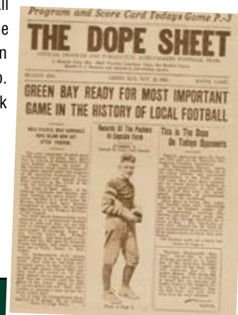
Two years after he co-founded the Packers with Curly Lambeau, George Calhoun began writing a piece called The Dope Sheet, which served as the official press release and game program from 1921-24.