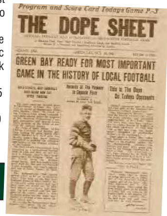
Two years after he co-founded the Packers with Curly Lambeau, George Calhoun began writing a piece called The Dope Sheet, which served as the official press release and game program from 1921-24.